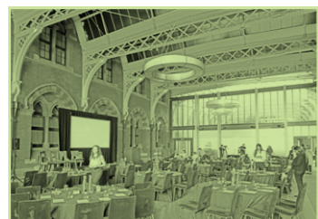
HANSOM HALL (HH)