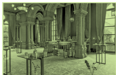
LADIES SMOKING ROOM (LSR)