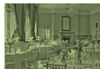
THE GALLERY (G)